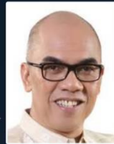
Mr. Boy Abunda (Lay Person)